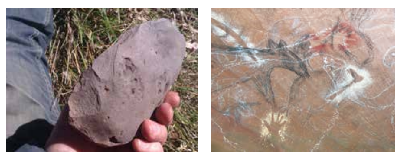
Figure 8: (L-R) Ground axe found at a hill top site within the Sydney Metro Northwest area and an example of Sydney Region Aborginal rock art with a mythical figure holding an axe. Sydney Metro Northwest Archaeological Salvage Program , Plate 10, page 22.

Several accounts of the use of ground-edge axes by Aboriginal people were documented by early British settlers in the Sydney region. Uses for ground-edge axes included: general woodworking, the removal of bark during the construction of canoes, shelters and shields and as weapons.