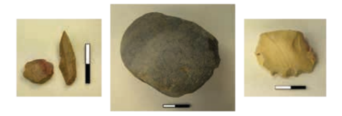
Figure 7: Examples of the types of stone artefacts found during Sydney Metro Northwest archaeological excavations in the North West region: (L-R) Thumbnail scraper and backed artefact, Hornfels hammerstone fragment and retouched chert flake. Sydney Metro Northwest Archaeological Salvage Program , Plate 36, page 96.