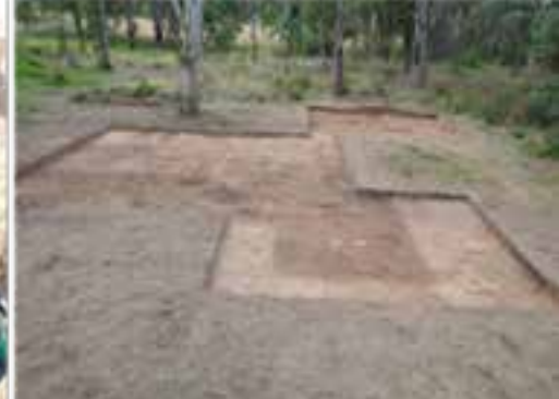
Figure 6: Completed open area.