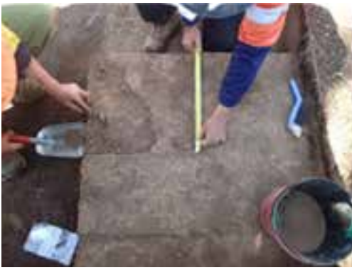
Figure 5: Recording artefacts in situ.